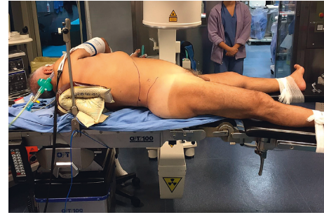
FIGURE 1: Patient's position on the operating table.

In the CT (computed tomography) study, the mean stone size was 2.2 cm. The stones were positioned in the renal pelvis (48.8%), in the inferior calyx (22.2%), and in the medium calyx (8.8%). No staghorn stones were documented. In 9 cases, we treated multicalyceal stones (20%). In these 9 cases, we preferred not to perform a secondary access but a combined antero- and retrograde procedure using a flexible ureteroscope. When possible, the stone was relocated in a place where lithotripsy could be performed through the percutaneous access; when this maneuver was not feasible, the stone was shattered using laser energy.