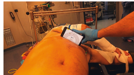
FIGURE 2: Measurement of the inclination of the patient's thorax through the app Protractor.